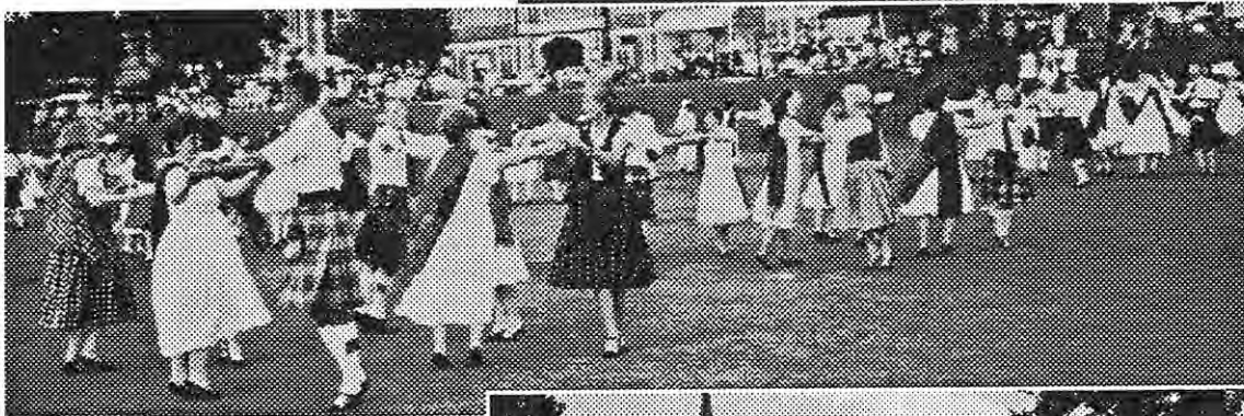
Right: Branch teams taking part in the mass dancing.