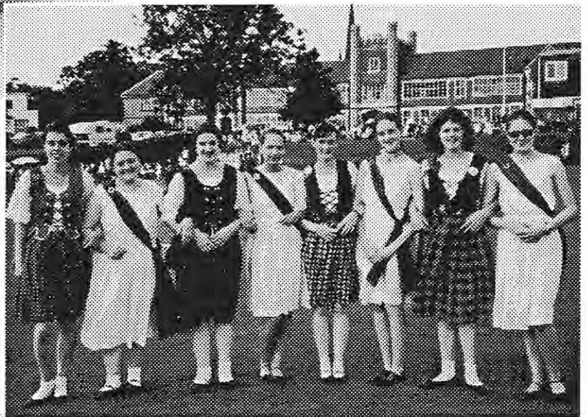
Right: Branch Brackenwood and teenagers teams dancing at the festival.