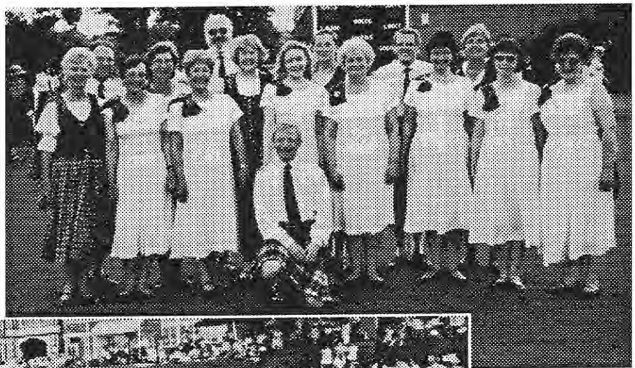
Above: Branch solo team.