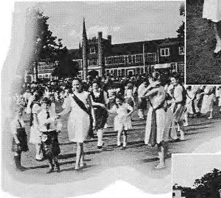
Below: Branch teenagers team.